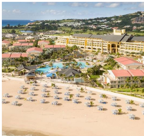
BEACH FRONT RESORT