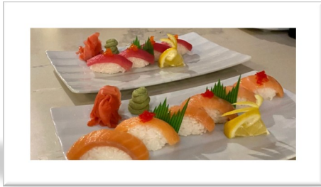
NIGIRI (2PC) / SASHIMI (4PC)

TUNA (MAGURO) 10/12 SALMON (SHAKE) 10/12 YELLOWTAIL (HAMACHI) 10/12 PRAWN (EBI) 9/10 BBQ EEL (UNAGI) 10/12